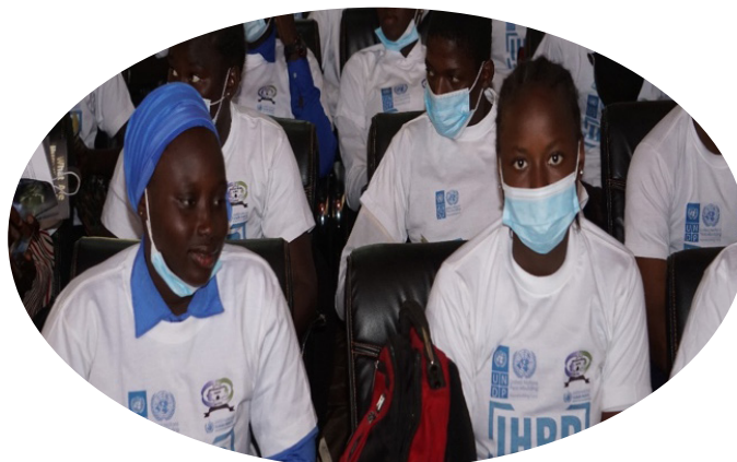
Students at the commemoration

The day-long event was one of the major activities of Beakanyang during the year; and it was marked by the following activities: