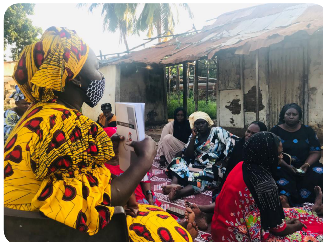
Constitutional forum in Mandinaba, WCR KMC Councilor facilitating a forum with women on the draft