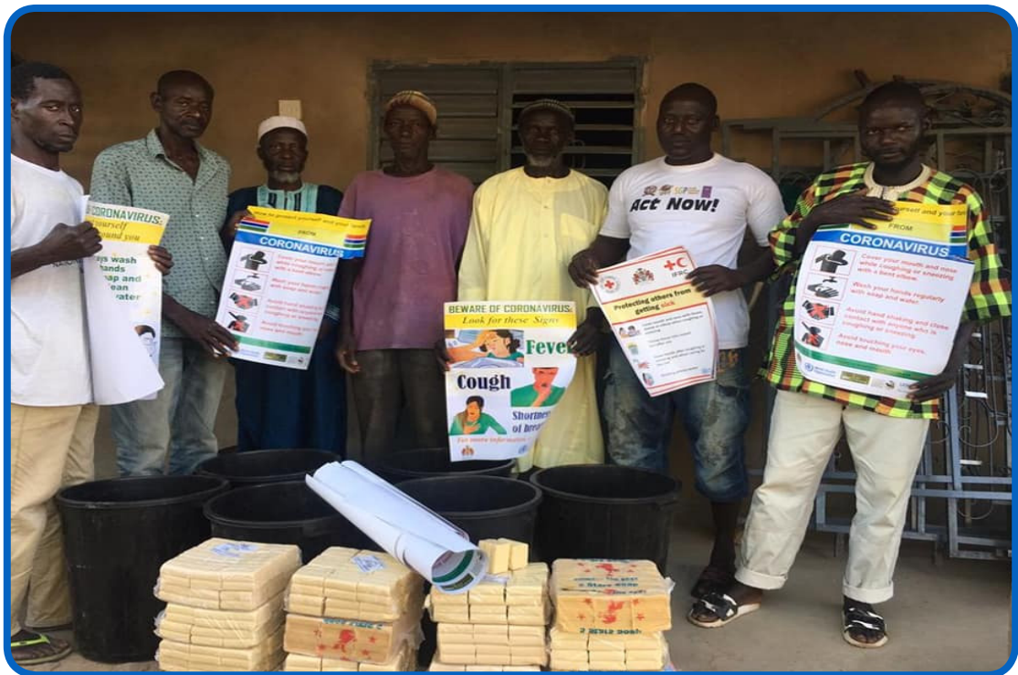
Village Development Committee members receiving the materials