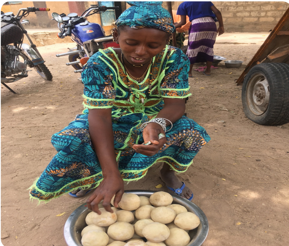
A beneficiary at Manakoto village with her product