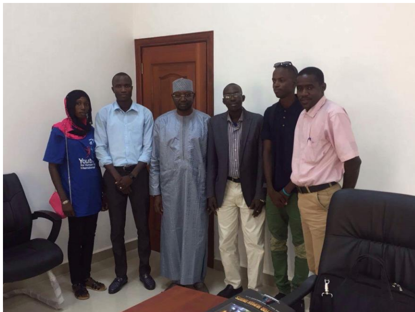
Beakanyang Officials with Minister of Interior

He cited the mass prisoner released and improvement of their conditions, establishment of an impartial judiciary, security sector reforms and free speech being enjoyed by Gambians among others.