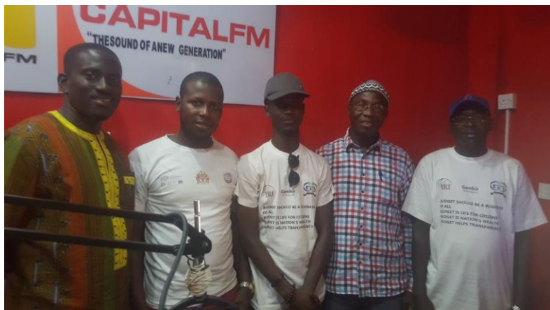
Budget campaigners at the radio station

In December 2017, Beakanyang in collaboration with Gambia Participate under the aegis of CSO Coalition on Budget Transparency hosted series of radio programs in the Greater Banjul Area.