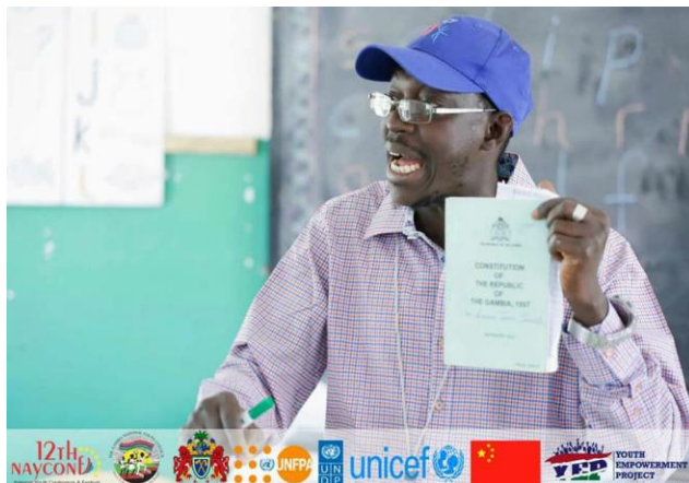
Mr Jawneh at NayConf

At the invitation of National Youth Council, NYC, Beakanyang directors attended the National Youth Conference and Festival, NAYCONF held in Base, Upper River Region from 17-21, December 2007 .