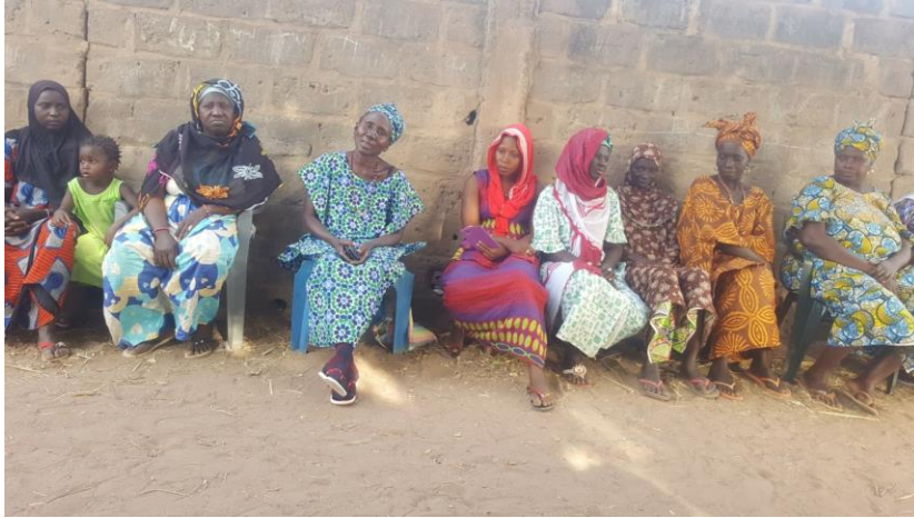
Group members at the launching

The community development unit of Beakanyng in December 2017 launched a 12-month garden project for the community of Kerewan in Wuli West District of Upper River Region.